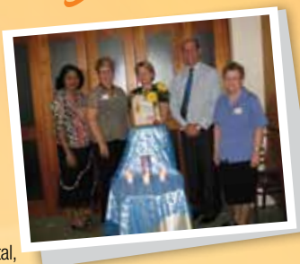
Ma Auley Place Mercy Day 2011