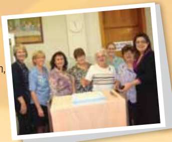
Bundaberg Mercy Day 2011