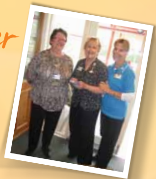
Leinster Place Mercy Day 2011