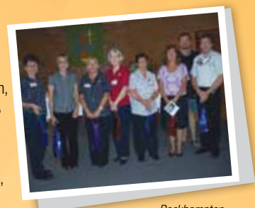
Rockhampton 10 Years