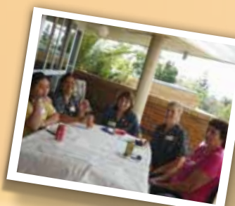
Bethany Mercy Day 2011