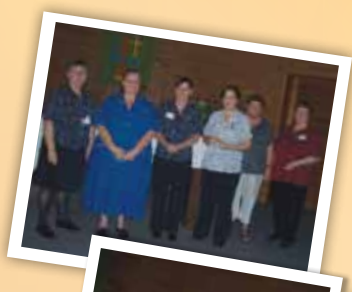
Rockhampton 25 Years